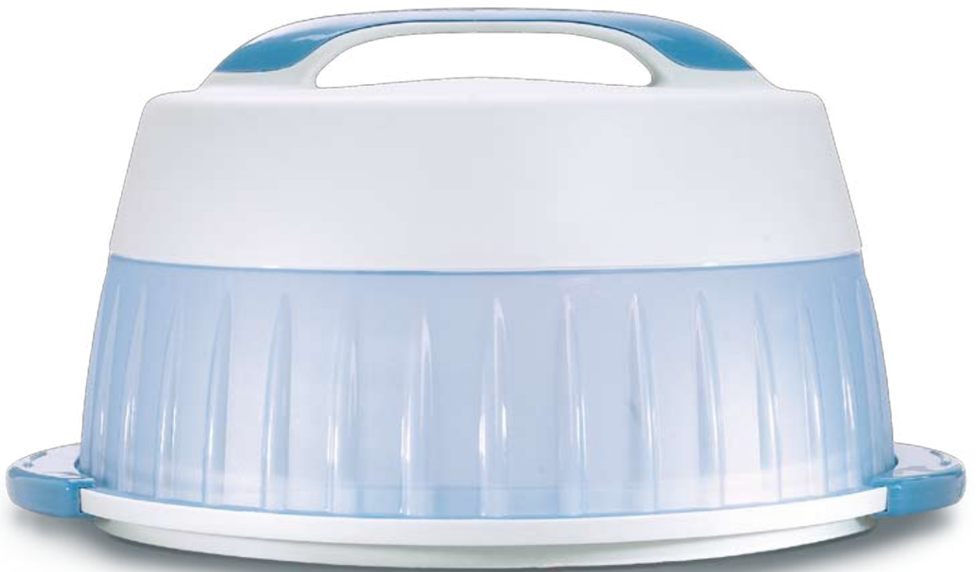
FRESH & CARRY PORTADOLCI TERMICO THERMAL CAKE CARRIER